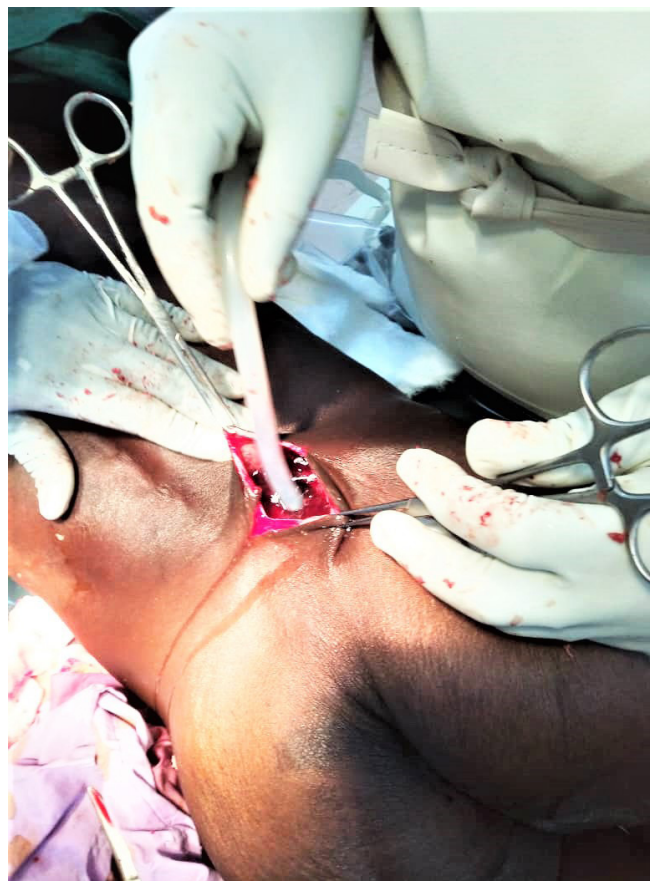
Figure 2. The wound being washed and aspirated with a sucker using normal saline for toileting the cavity.

Surgical success is partly dependent on the careful